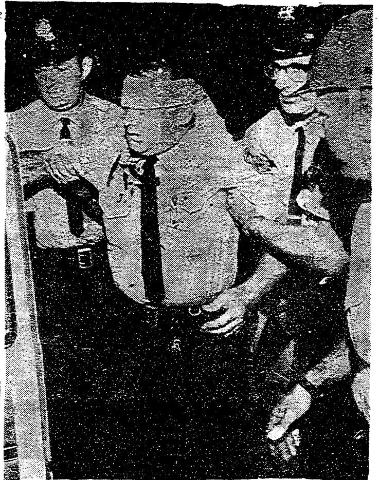
POLICEMAN GETS HELP

FOR QUICKER RESPONSE, send us a stamped self addressed envelope